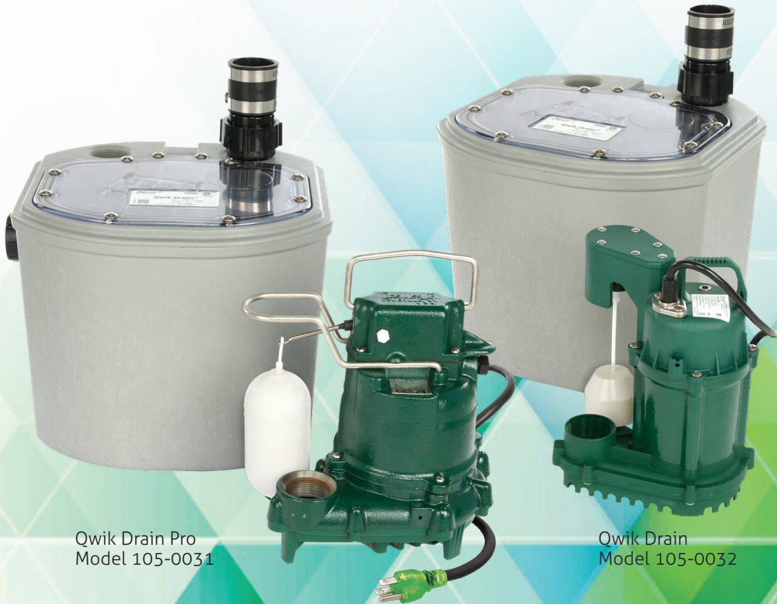
Qwik Drain Pro Model 105-0031